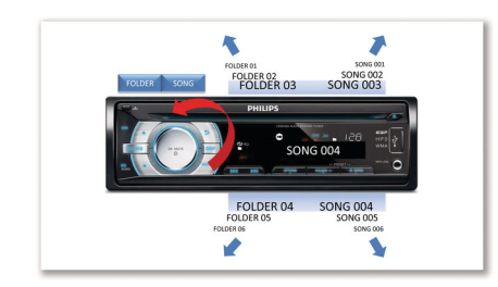
This function allows you to find a track or album much faster by letting you browse

through songs and folders, which are the usual contents of USB/SDHC devices. With the dedicated folder/song button, only three simple steps are needed to make a search – press folder/song, rotate the volume knob and push to select. This simple process lets you search through your music quickly and easily, letting you to focus on your driving.